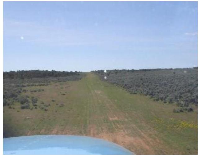
Touchdown at Dolores Point