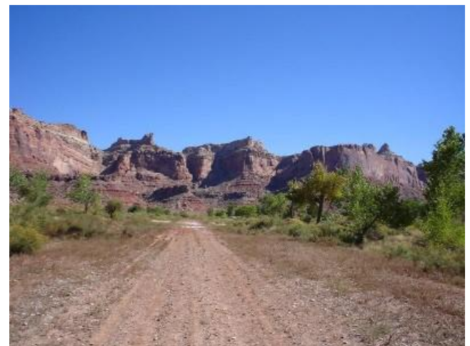
Mexican Mountain Touchdown