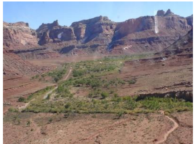
Mexican Mountain Long Final